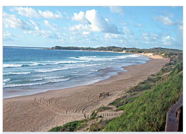
The dunes of Tofo and Bazaruto island are among the best developed along the East African coast.