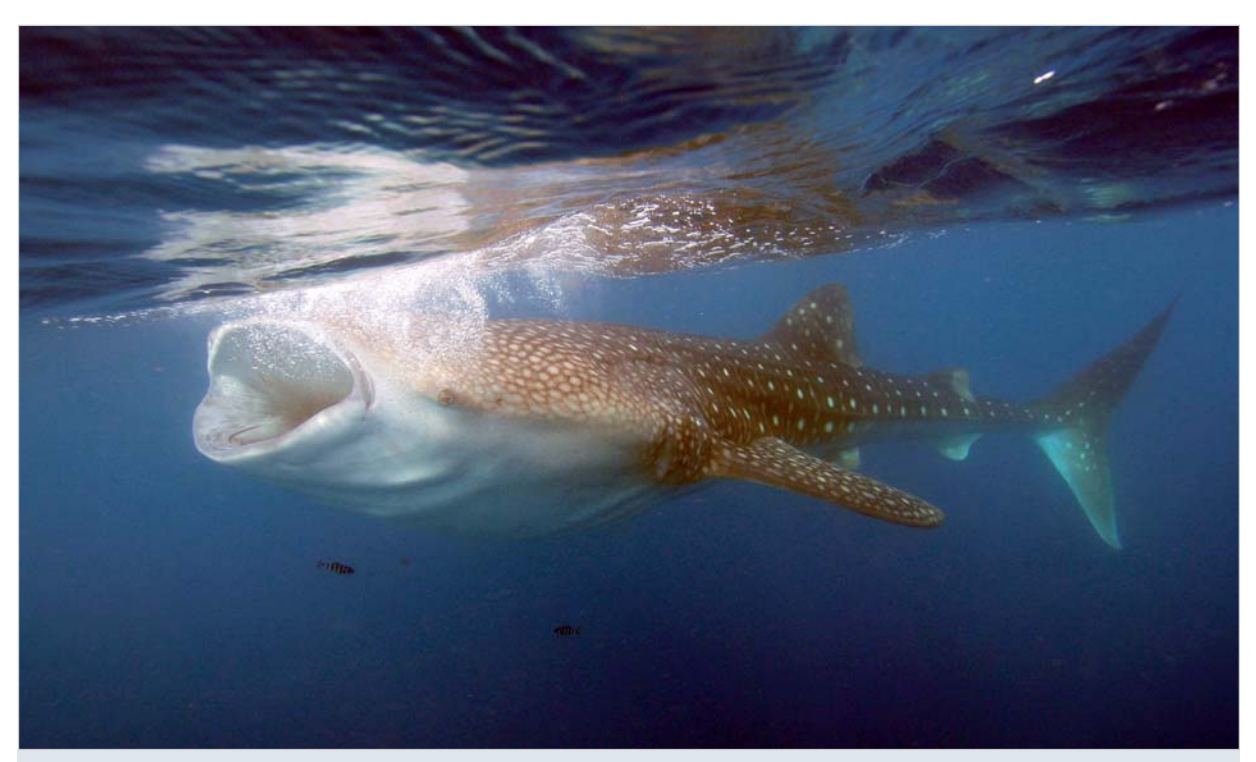
Whale shark feeding on surface plankton, attracted by the high productivity created by eddies and their complex interactions with the continental shelf.