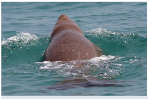
Dugong photographed from boat, Bazaruto.