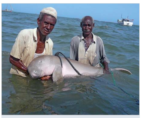
Dugong are particularly vulnerable to capture in nets. This juvenile dugong was released alive from a net in the Kiunga Mairne Reserve, Kenya.

The continental shelf off Mozambique holds considerable mineral resources such as oil, gas and heavy metals, posing significant threats to biodiversity when extraction occurs. Overexploitation occurs of many marine resources, including fish, holothurians, and molluscs, as well as sea turtles, dugongs, sharks and birds eggs. A significant net fishery is based on the mainland coastline, targeting the extensive shallow waters that also host the main seagrass beds and dugong habitat. Of particular concern is that a large proportion of the dugong population occurs outside of protected areas, where they face a high risk of net entanglement. Habitat destruction, particularly of seagrass beds is a huge concern for the dugong population. Tourism developments, if not well managed could be a serious threat to the ecosystems and habitats, particularly the sensitive sand dune and Salinas terrestrial habitats. Natural events such as storms and cyclones, and climate change, have also had negative impacts on habitats.